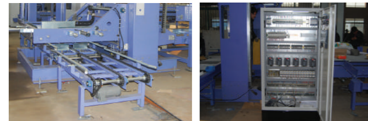
PALLETIN® YZ- P40