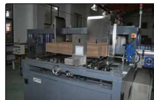
Cardboard infeed system

This machine arranged products in line through the mesh belt conveyor, it divide product in six, five or four lines (change according to different packing modes). The blank cardboards are stacked in the stocking bin, pulled down with robotic arm theory and pushed advanced by roller. When the cardboard and product reach the anchor point, shaking the product side to side and fell on the cardboard lightly. There is a set of cylinder and a sucker under the cardboard, the sucker pull the cardboard and product down, molding the case. After molding, the chain drive advances the case to the spraying station to finish bonding.