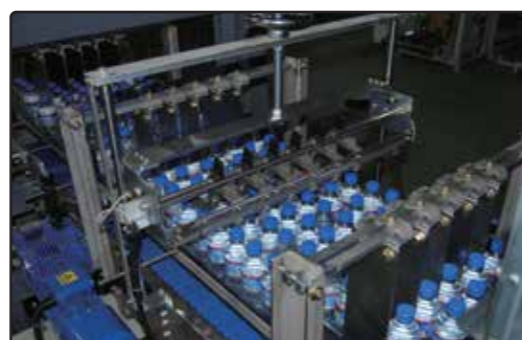
Buffer gear for product

This machine composes of container infeeding, container spacing, carton sucking & conveying, carton folding, gluing & sealing, pneumatic and electric control. According to customers' requirements, containers from filler are divided into several lanes by infeed conveyor, and move to the distributing lane of packing device, blanks are synchronously taken beneath each group of products by the sucking & conveying device, and products will be packed by the folding and glue sealing device; each units are synchronized by 5 servo motors and mechanical adjustment, ensuring products packing accurate and artistic.