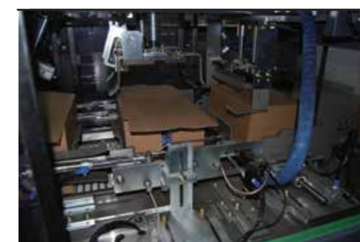
Case forming and adhesiving system

This machine structure is compact, can design smallest floor area according to the actual site. The main frame adopts fully enclosed welding structure. It is easy to clean and ensure that no residue liquid or water after cleaning. The slot should be installed away from the damp environment as possible; Based on the reason of maintenance services and adjustment, all institutions design should follow to the principle that make the operator can conveniently access. All vulnerable and dangerous parts must be installed shield.