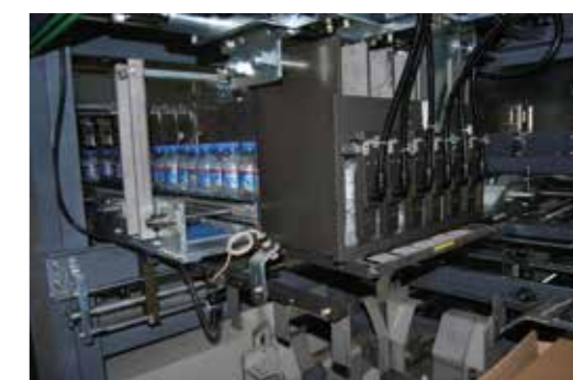
Product into case system