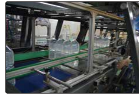
Bottle grouping system