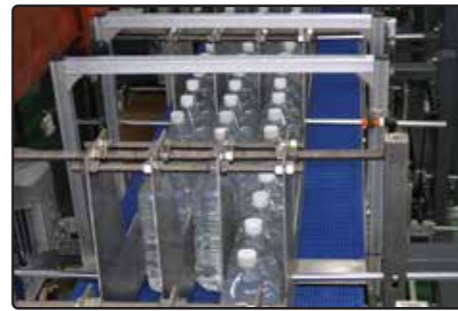
Bottle infeding system

This equipment use servo-drive control technology, accurate position, soft motion, easy for operation and setting, free to adjust running speed, have a large cardboard storage, storing range is 800 pieces of cardboard and artificial pile up easily. This machine has large production capacity, high efficiency, good continuity, running stability, cardboard breakage rate is very low, carton firmly bond, the forming beautiful.