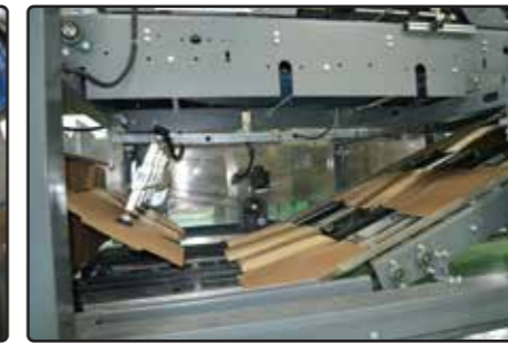
Cardboard infeding system