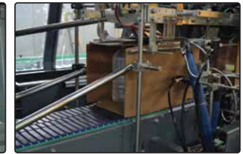
Case Forming System