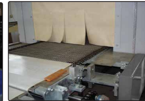
Hot Shinking system