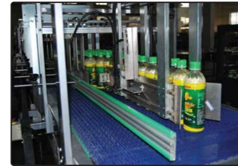
Product infeed system